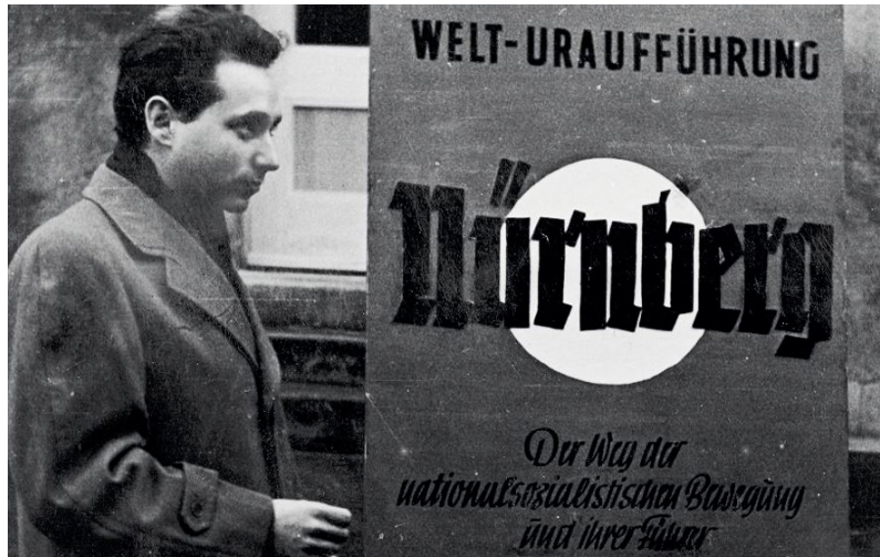
Writer-director Stuart Schulberg at Nuremberg's 1948 premiere in Stuttgart, Germany.

[The 2009 Schulberg/Waletzky Restoration]