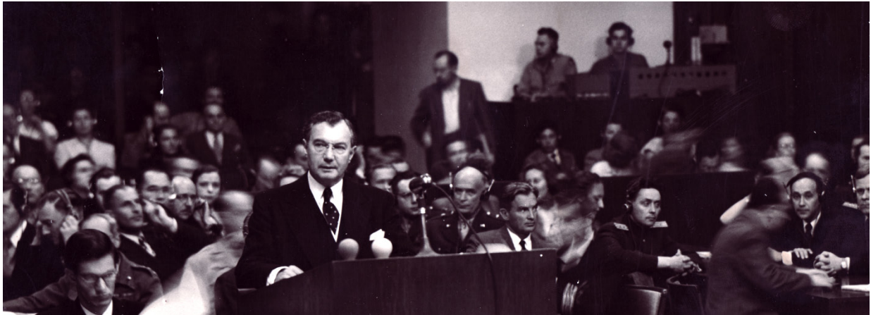
Justice Robert H. Jackson served as Chief U.S. Prosecutor at the Nuremberg trial.

[The 2009 Schulberg/Waletzky Restoration]