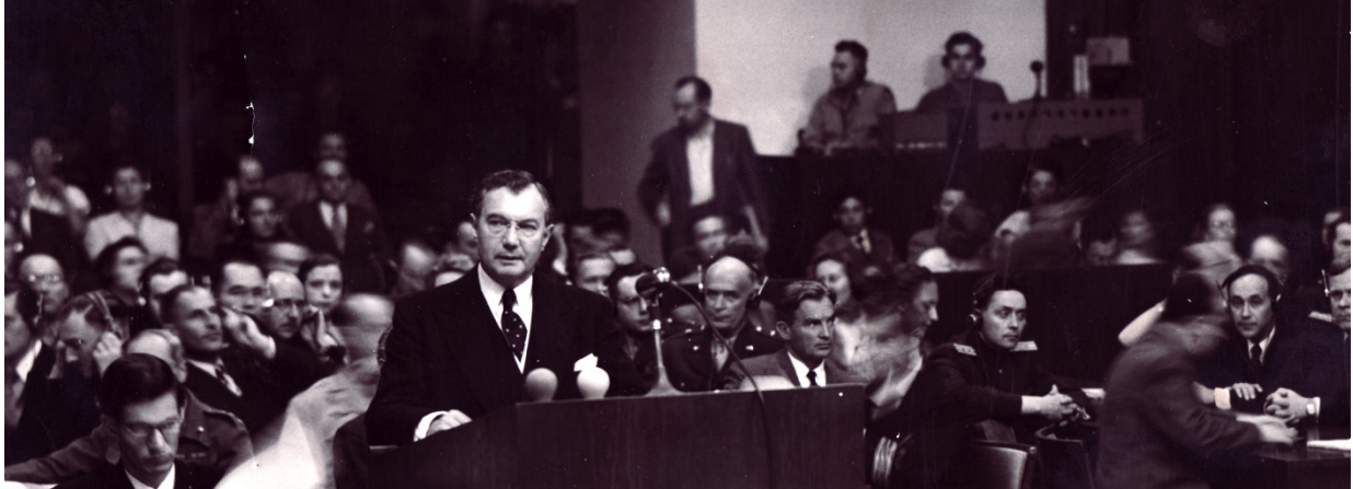
Justice Robert H. Jackson served as Chief U.S. Prosecutor at the Nuremberg trial.

[The 2009 Schulberg/Waletzky Restoration]