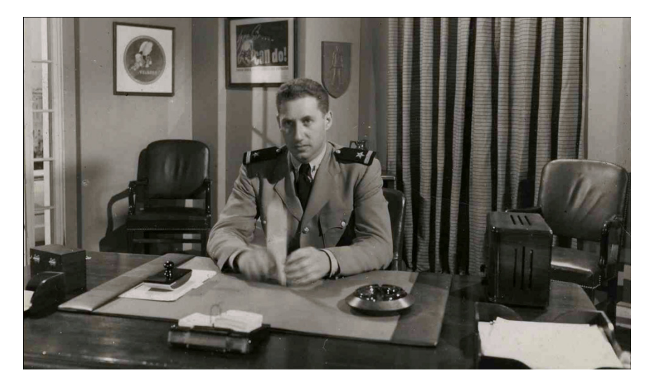
Navy Lt. Budd Schulberg, an officer in the OSS Field Photo-War Crimes unit, supervised compilation of The Nazi Plan and Nazi Concentration Camps for presentation at Nuremberg trial.